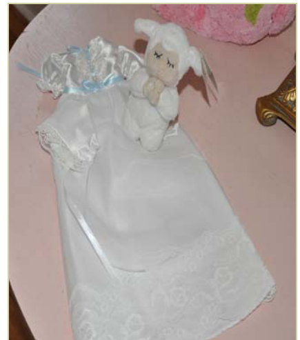
Above: A picture of one of the beautiful gowns. Below: Happy Hollow 4-H and Army of Christ Youth Group.

We are excited to get started and are so inspired by and grateful for these strong, young leaders. Their gowns will dress future little saints!